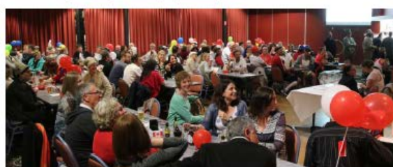
Competitors at the ready – next question please!