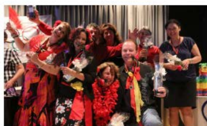
Oro (gold) for Spain - felicitaciones (congratulations)!